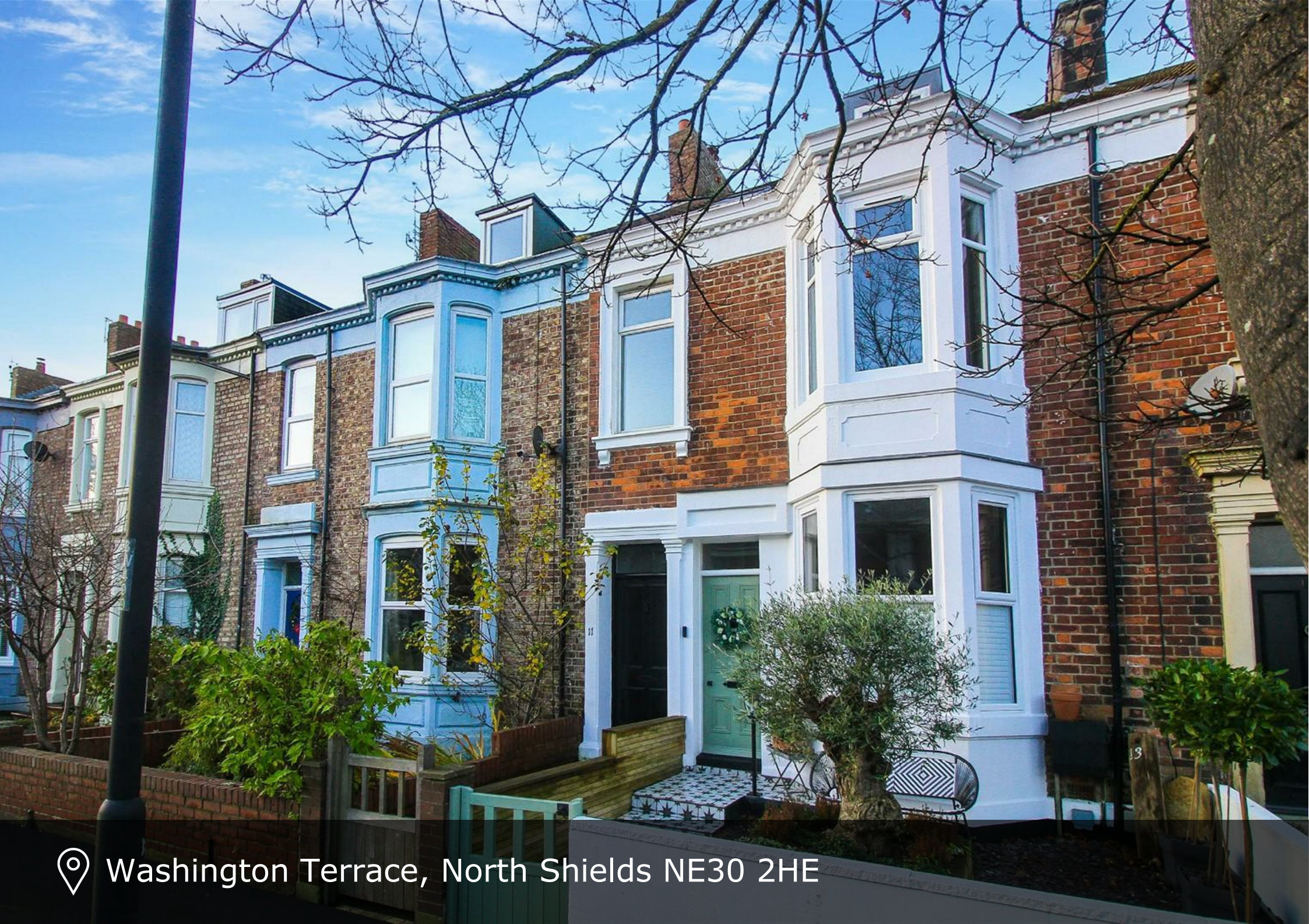
📍 Washington Terrace, North Shields NE30 2HE