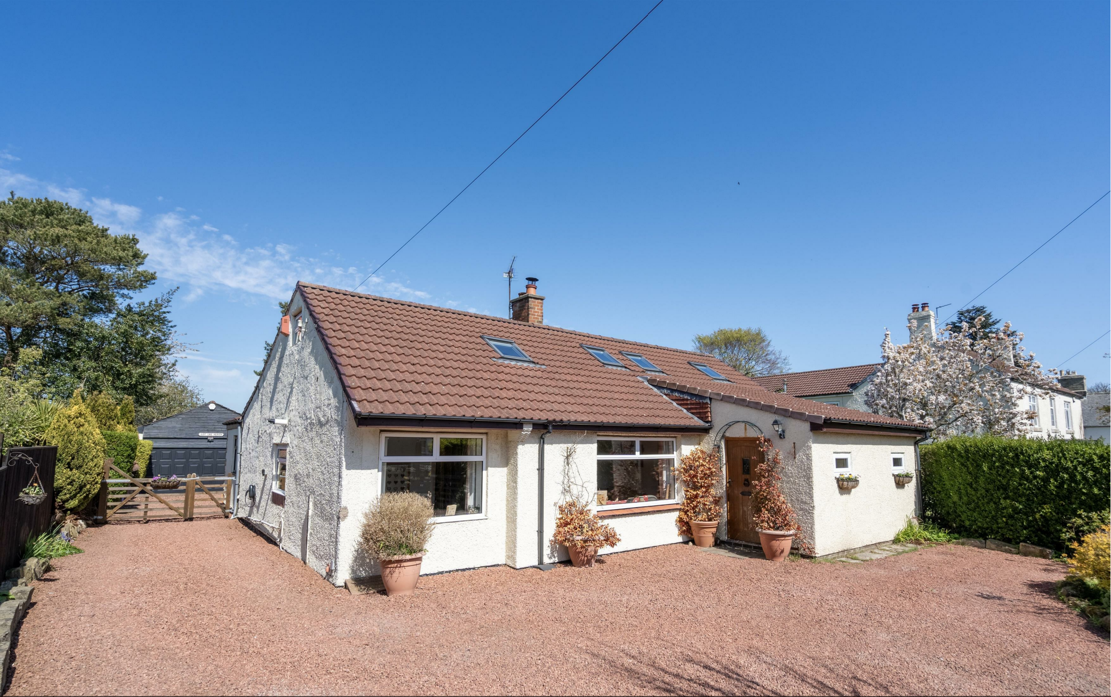
📍 Ulgham Village Main Road, Morpeth NE61 3AW