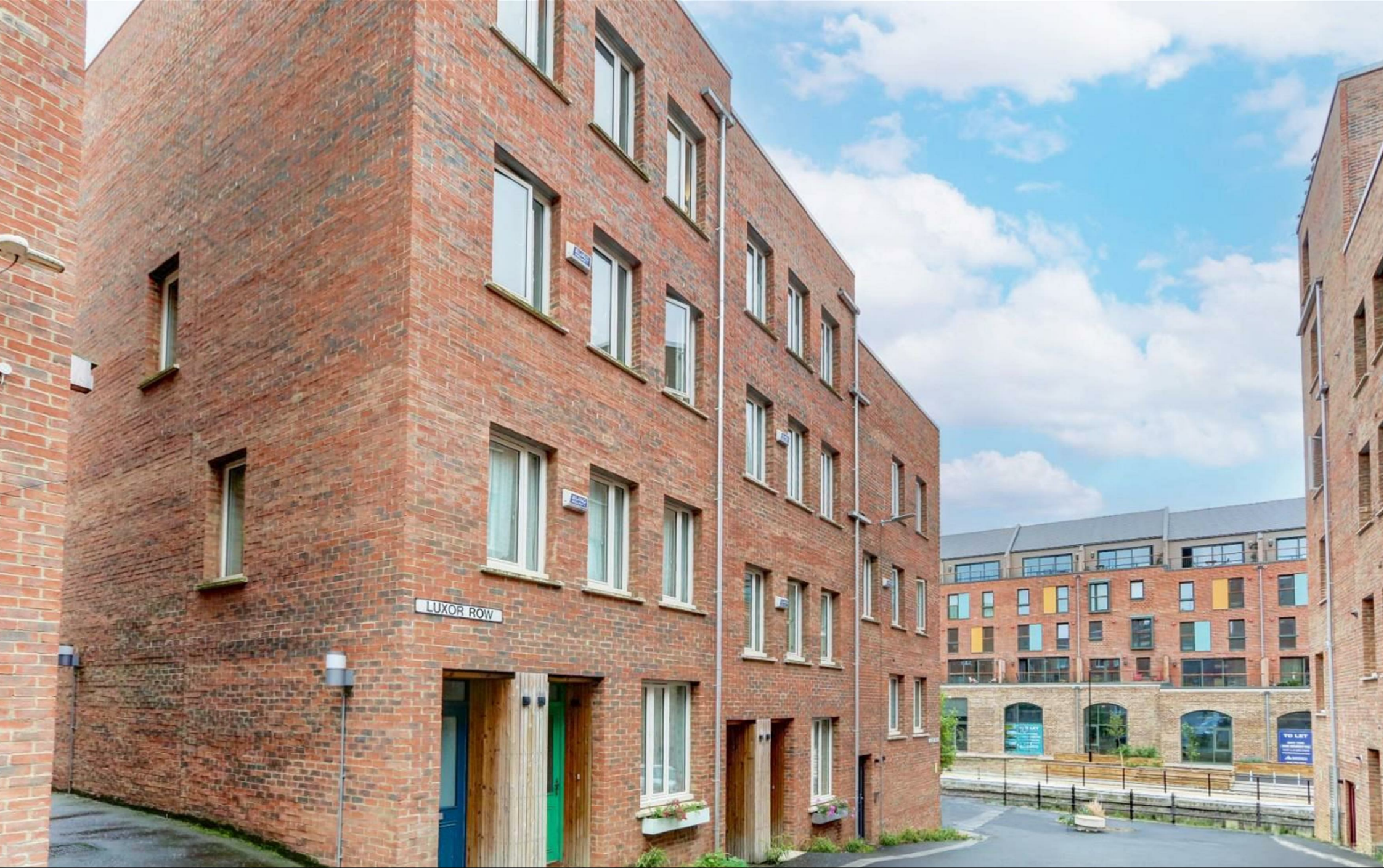
📍 Luxor Row, Newcastle Upon Tyne NE6 1LG