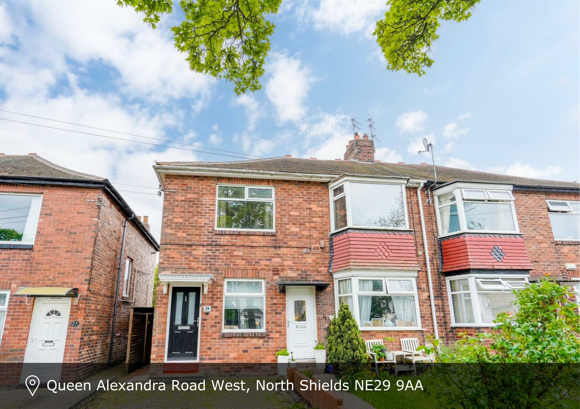
📍 Queen Alexandra Road West, North Shields NE29 9AA