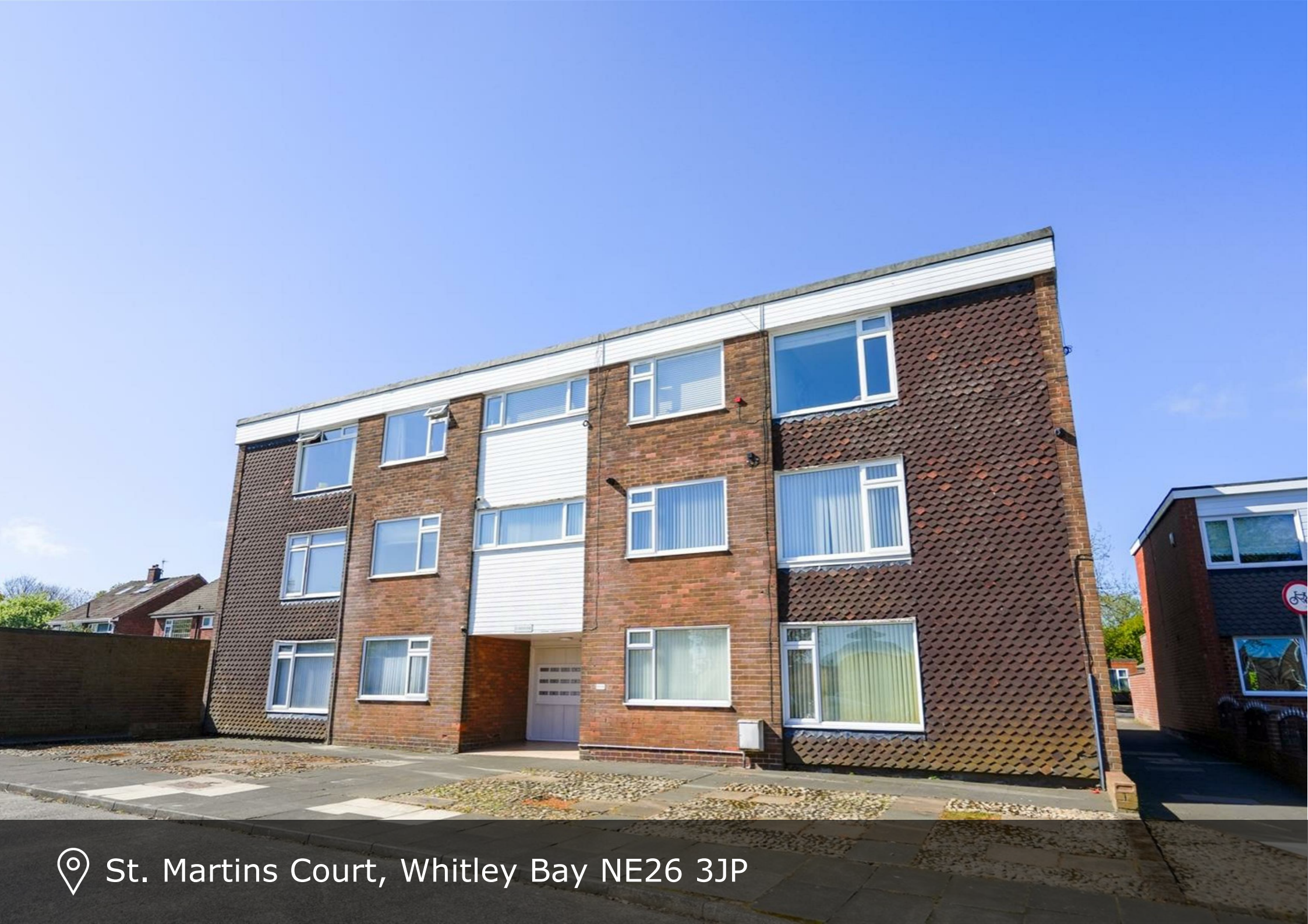
📍 St. Martins Court, Whitley Bay NE26 3JP