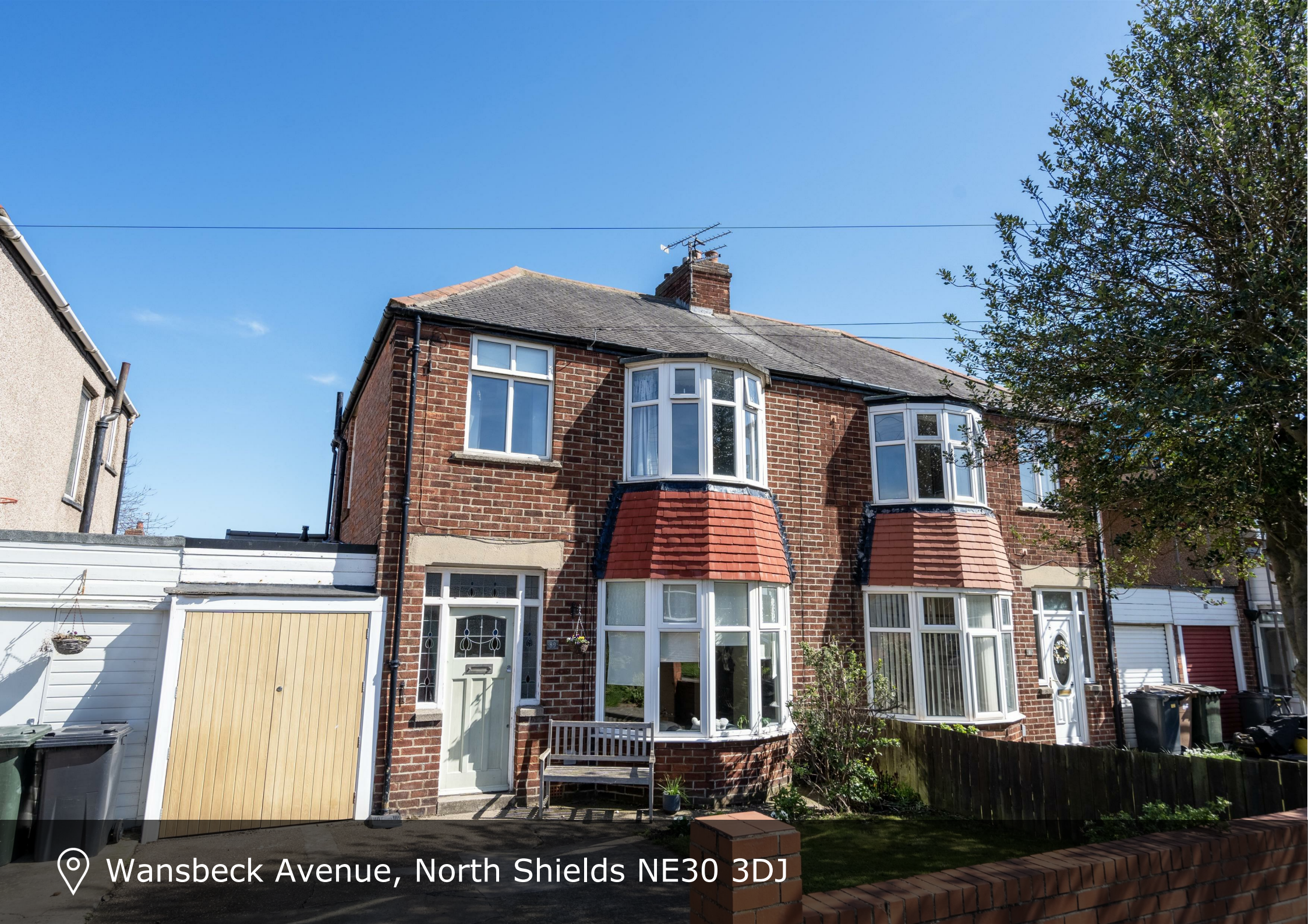
📍 Wansbeck Avenue, North Shields NE30 3DJ