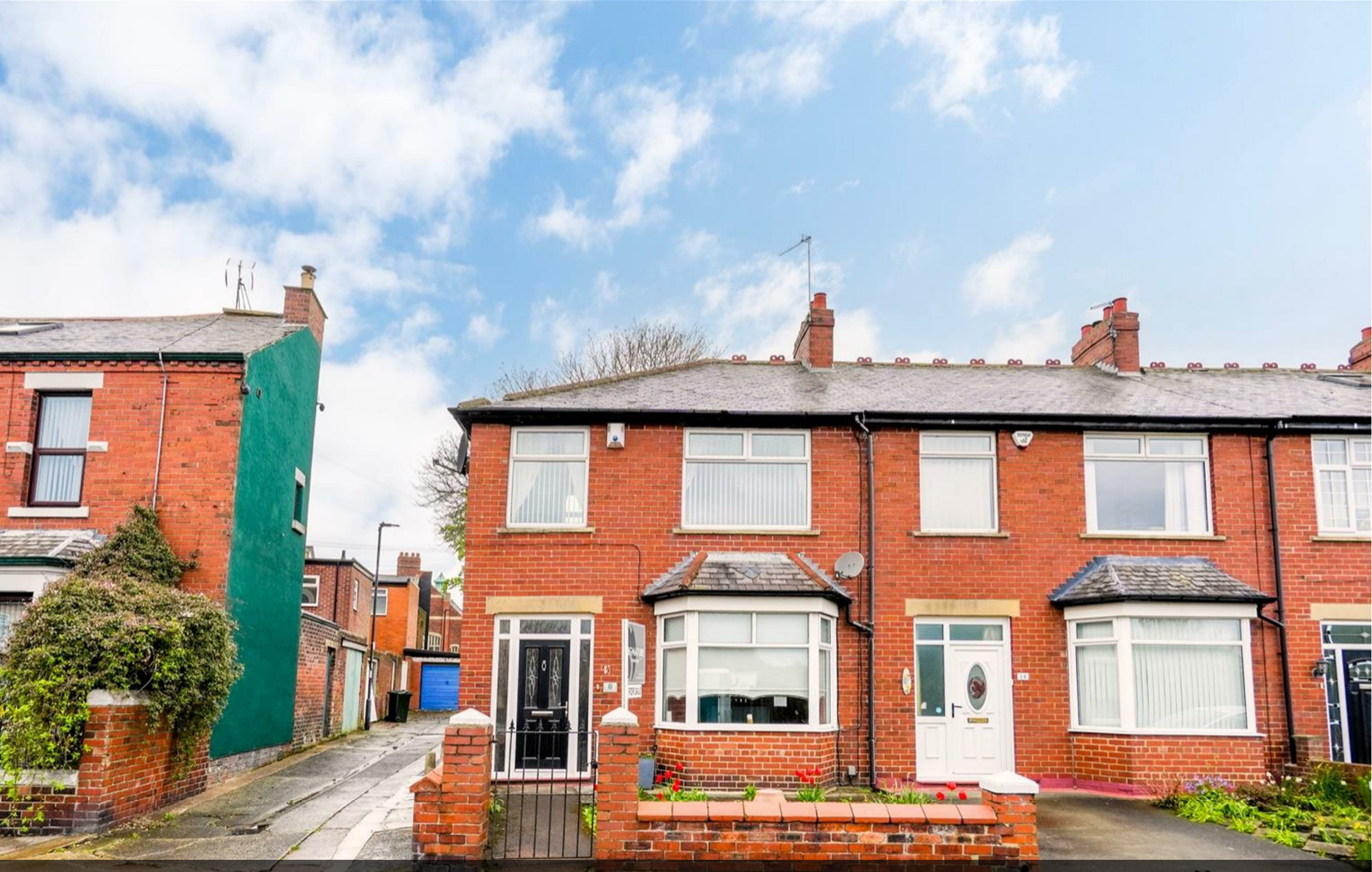
📍 Windermere Terrace, North Shields NE29 0PG