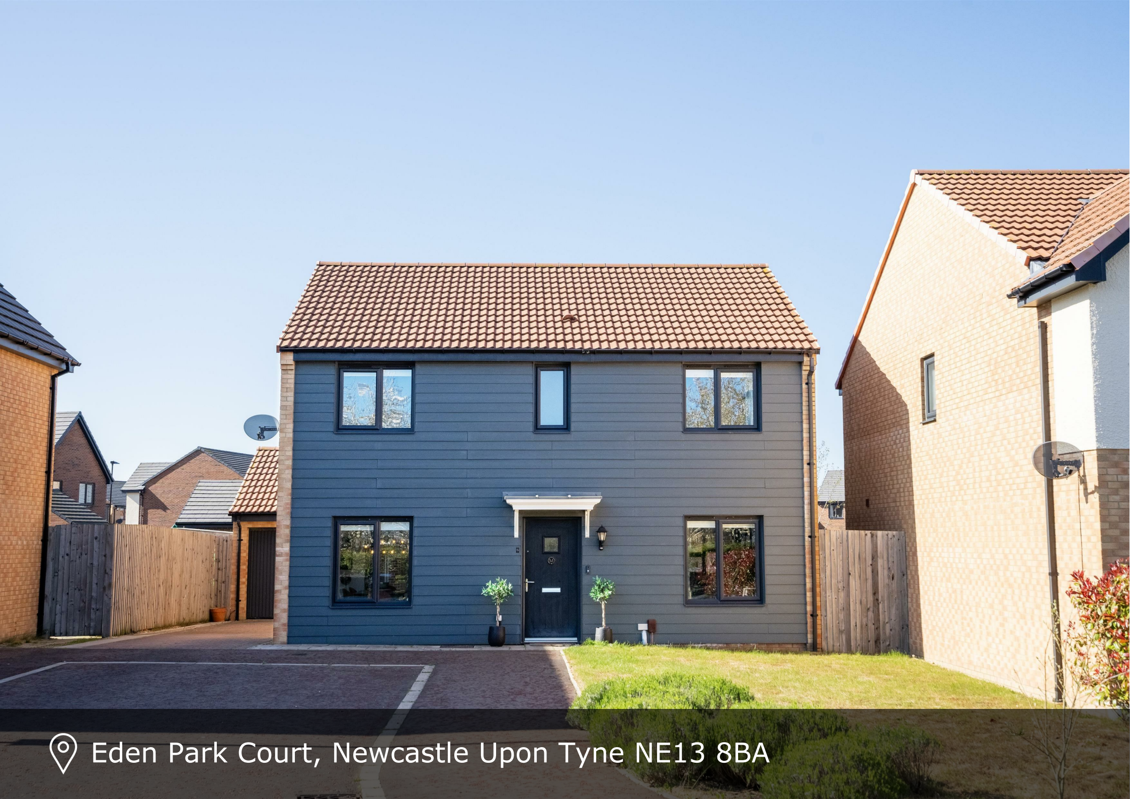
📍 Eden Park Court, Newcastle Upon Tyne NE13 8BA