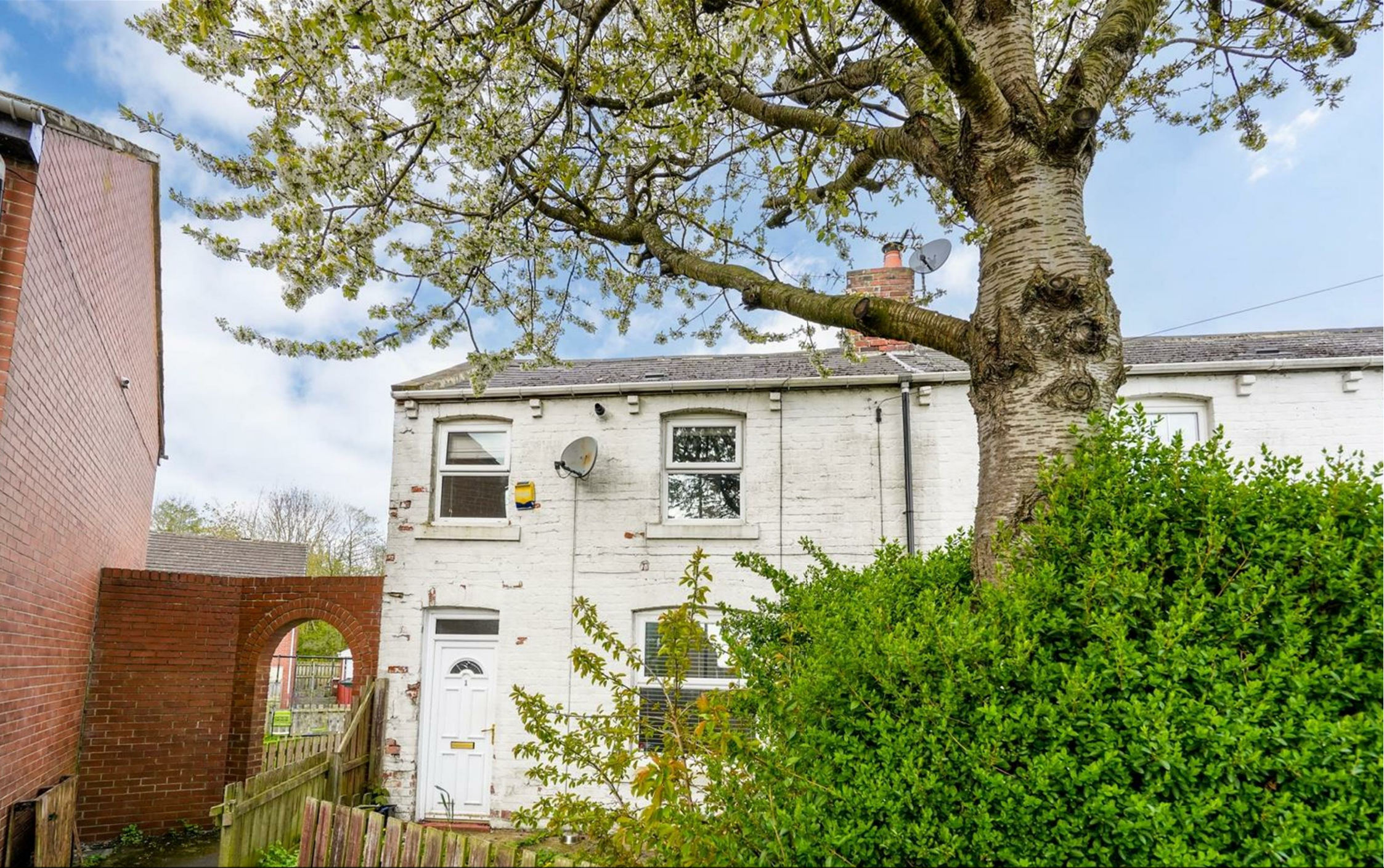
📍 Chapel Place, Newcastle Upon Tyne NE13 6EX