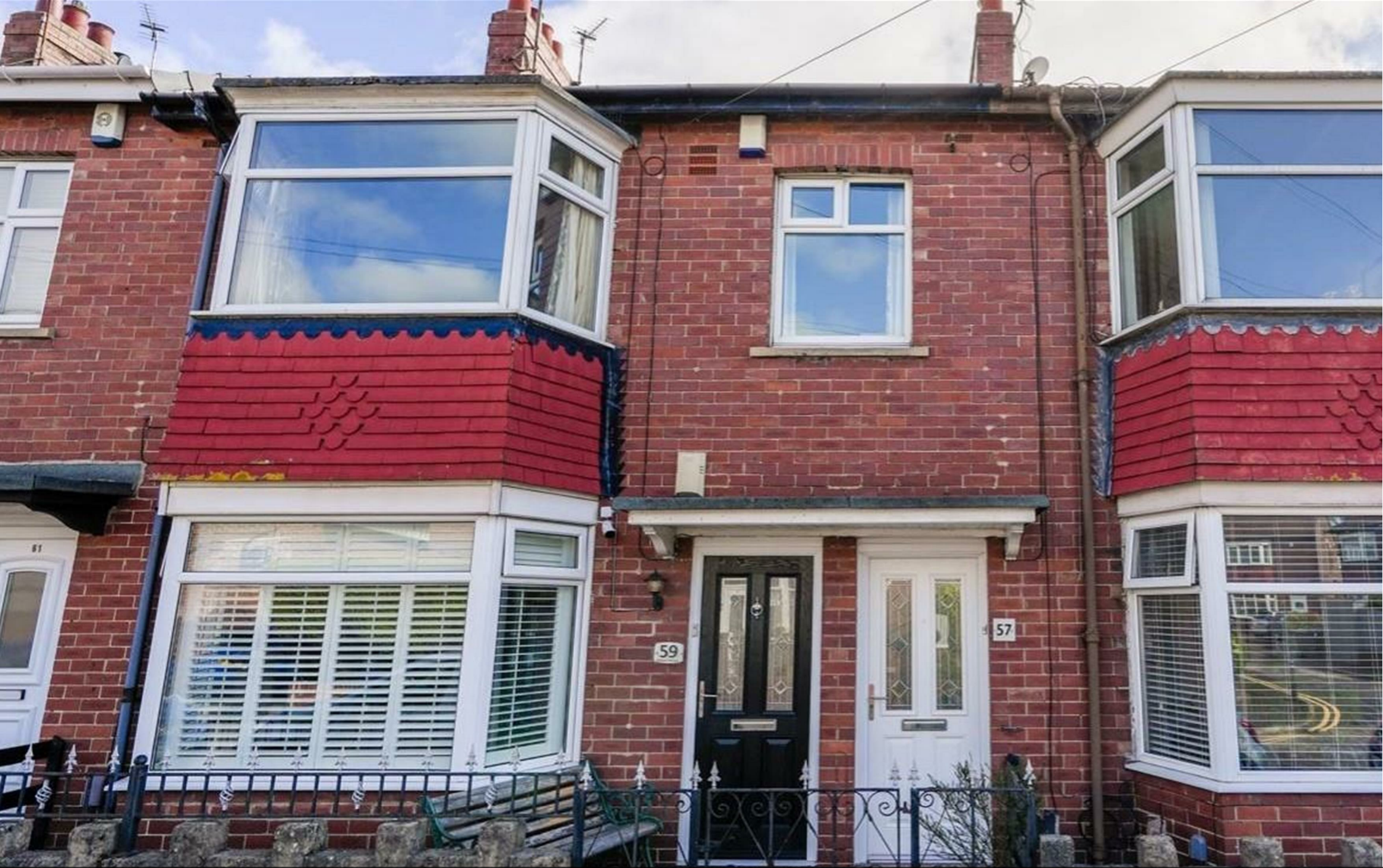
📍 Milton Terrace, North Shields NE29 0PB