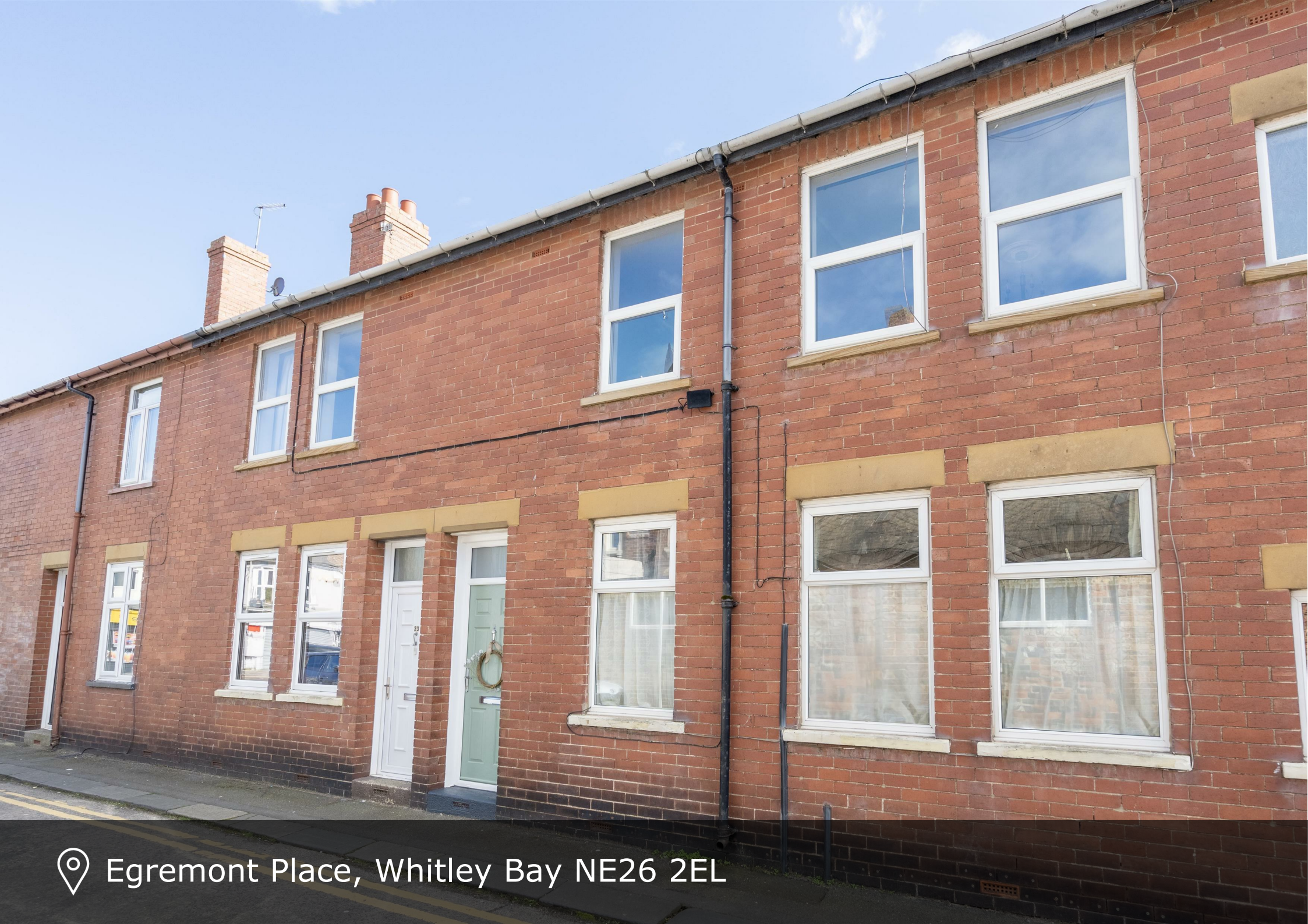
📍 Egremont Place, Whitley Bay NE26 2EL