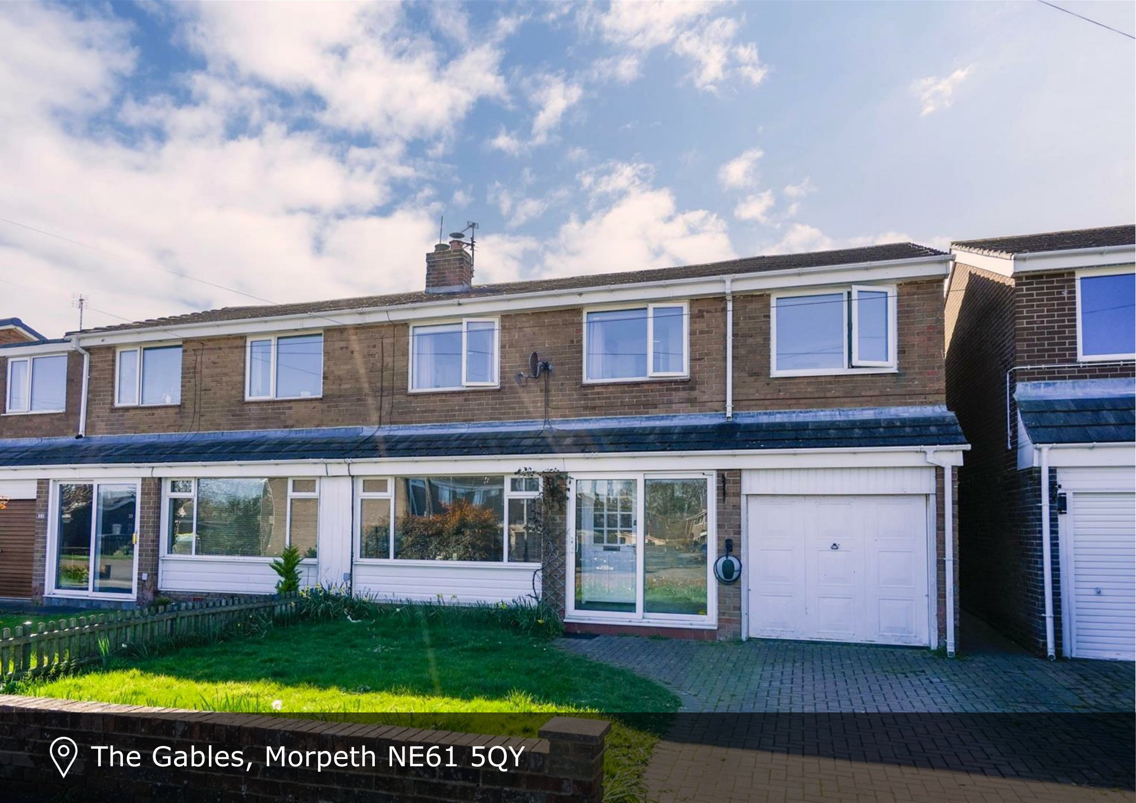
📍 The Gables, Morpeth NE61 5QY