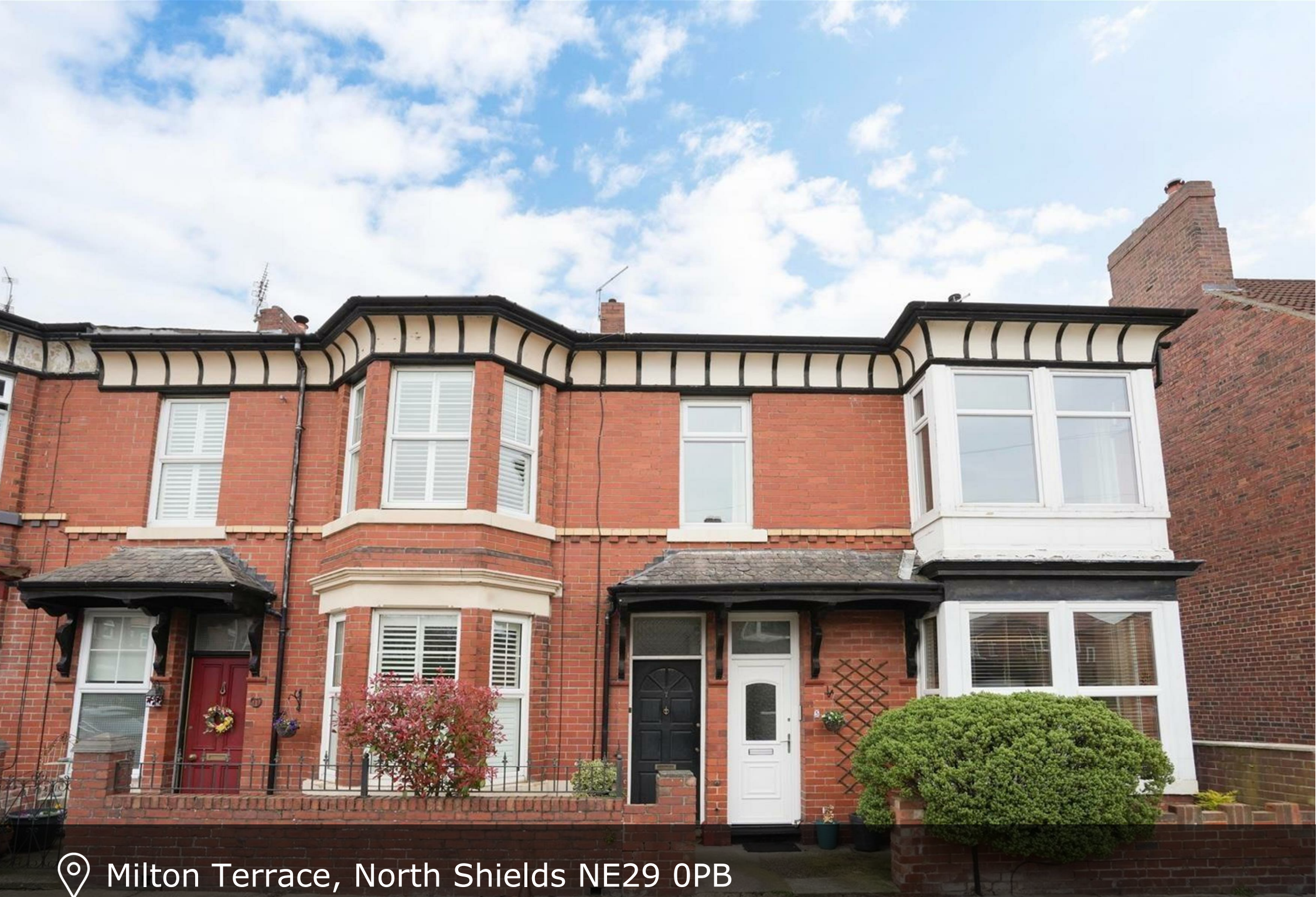
📍 Milton Terrace, North Shields NE29 0PB