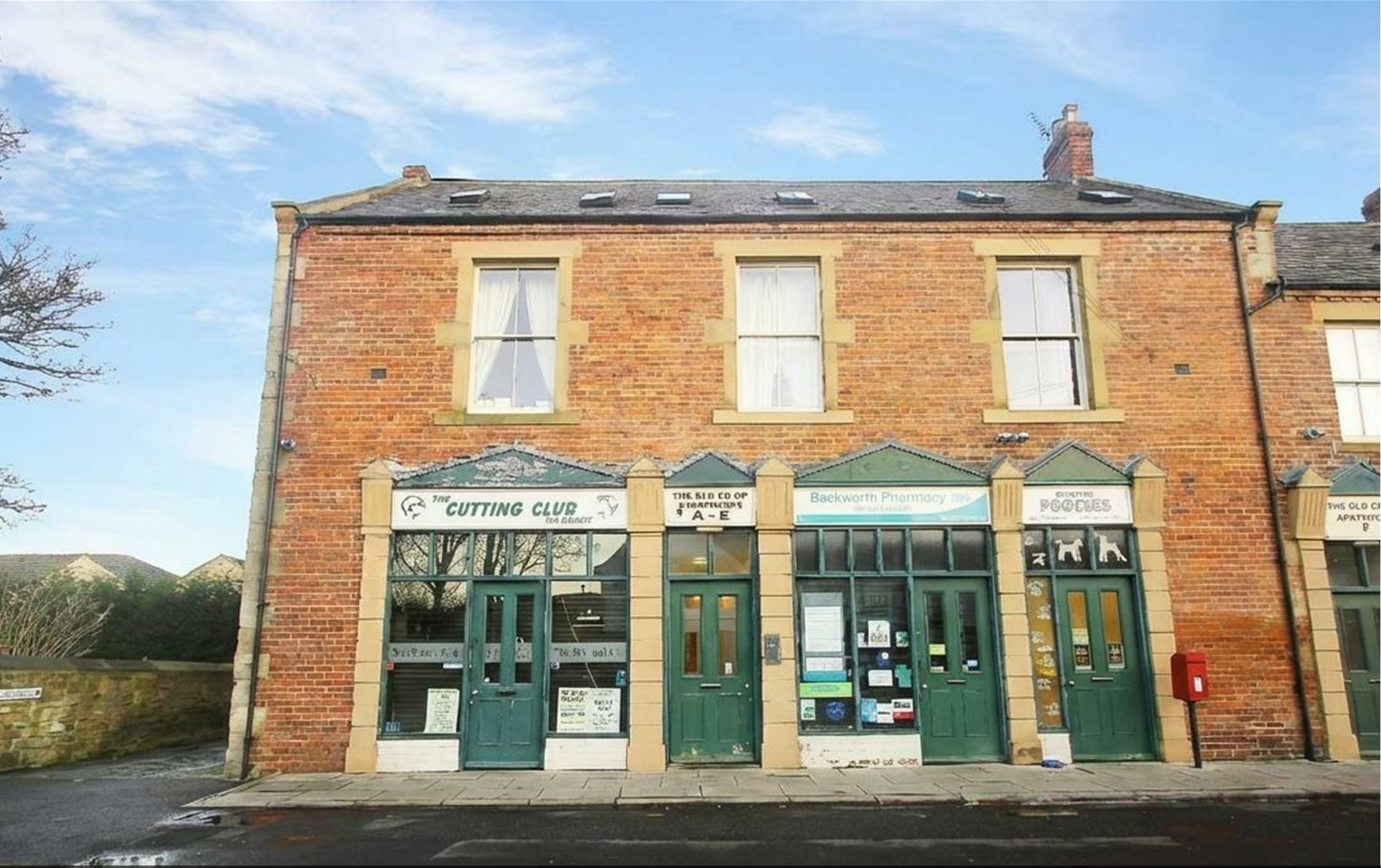
📍 Old Co-Op Buildings, Backworth NE27 0JE