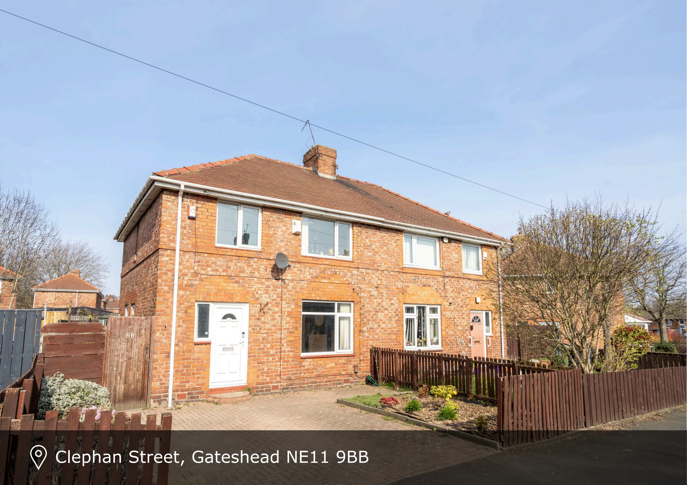
📍 Clephan Street, Gateshead NE11 9BB