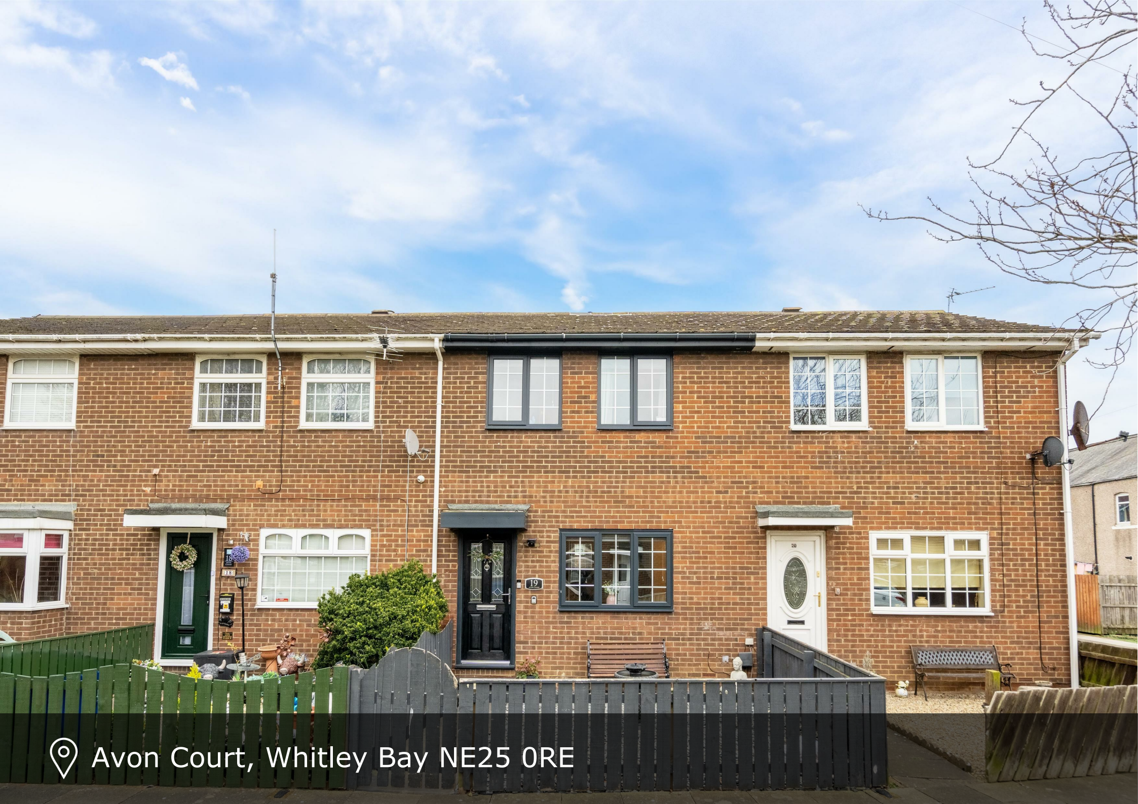
📍 Avon Court, Whitley Bay NE25 0RE