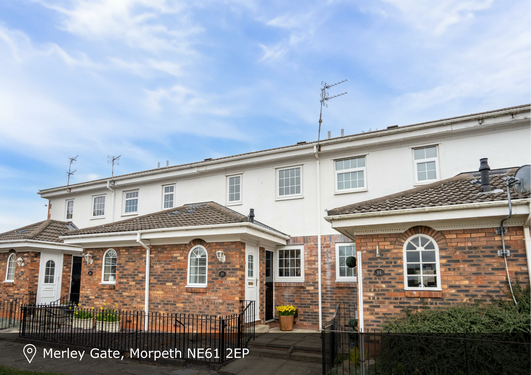
📍 Merley Gate, Morpeth NE61 2EP