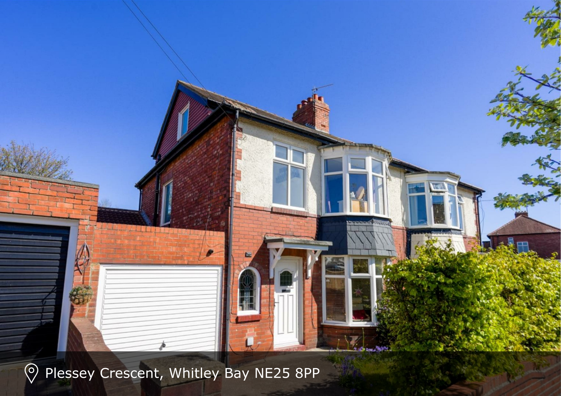
📍 Plessey Crescent, Whitley Bay NE25 8PP