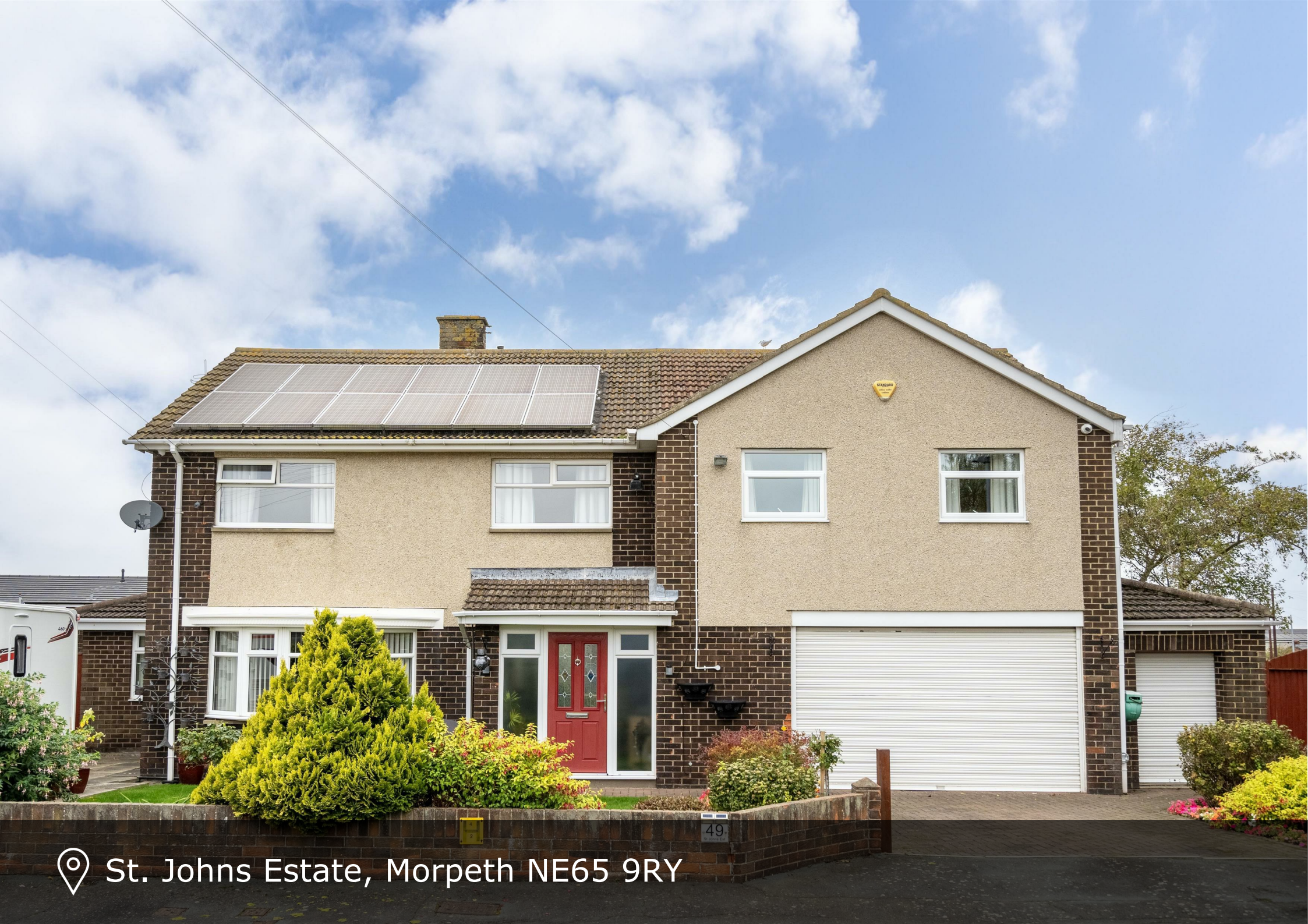
📍 St. Johns Estate, Morpeth NE65 9RY