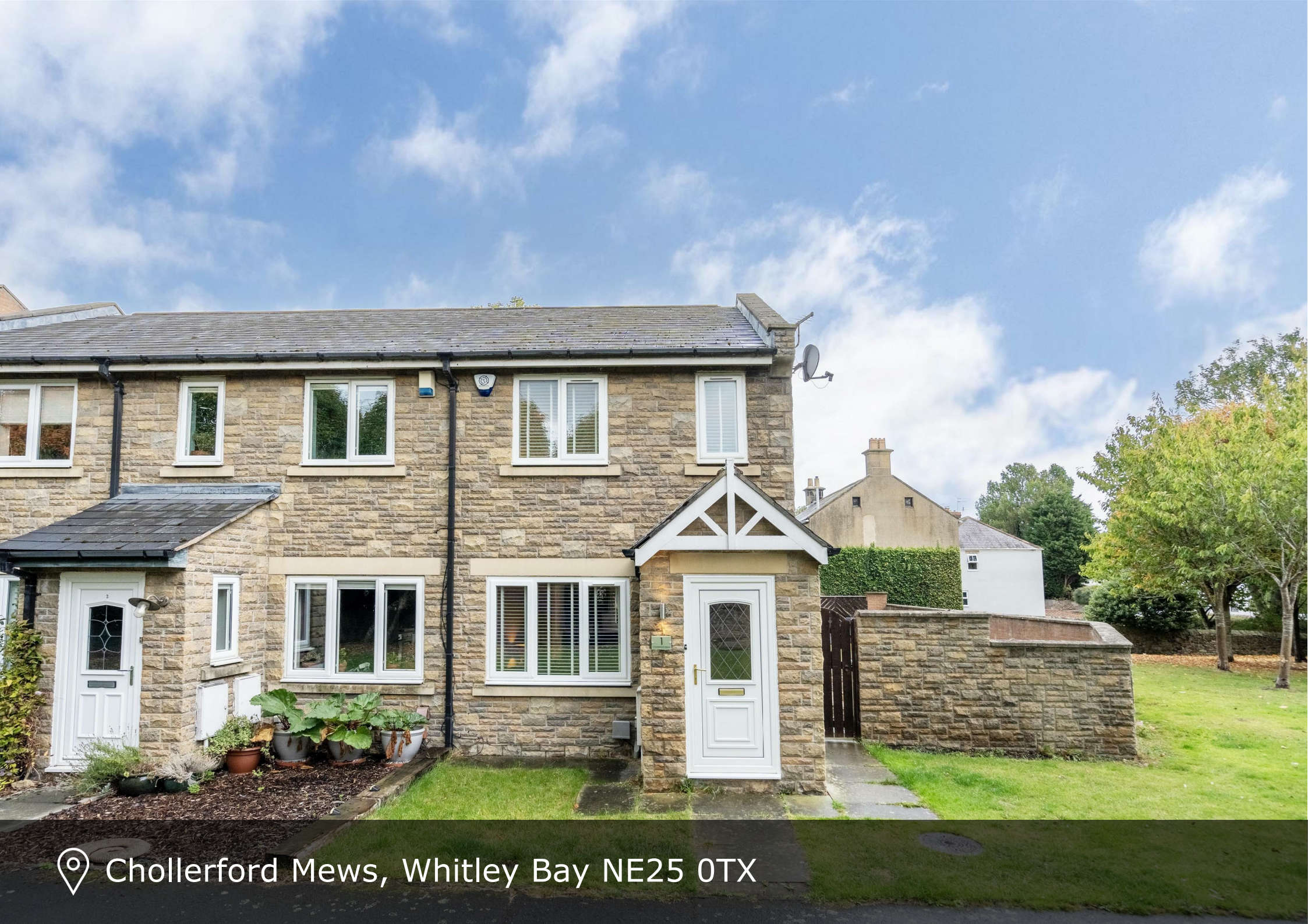
📍 Chollerford Mews, Whitley Bay NE25 0TX