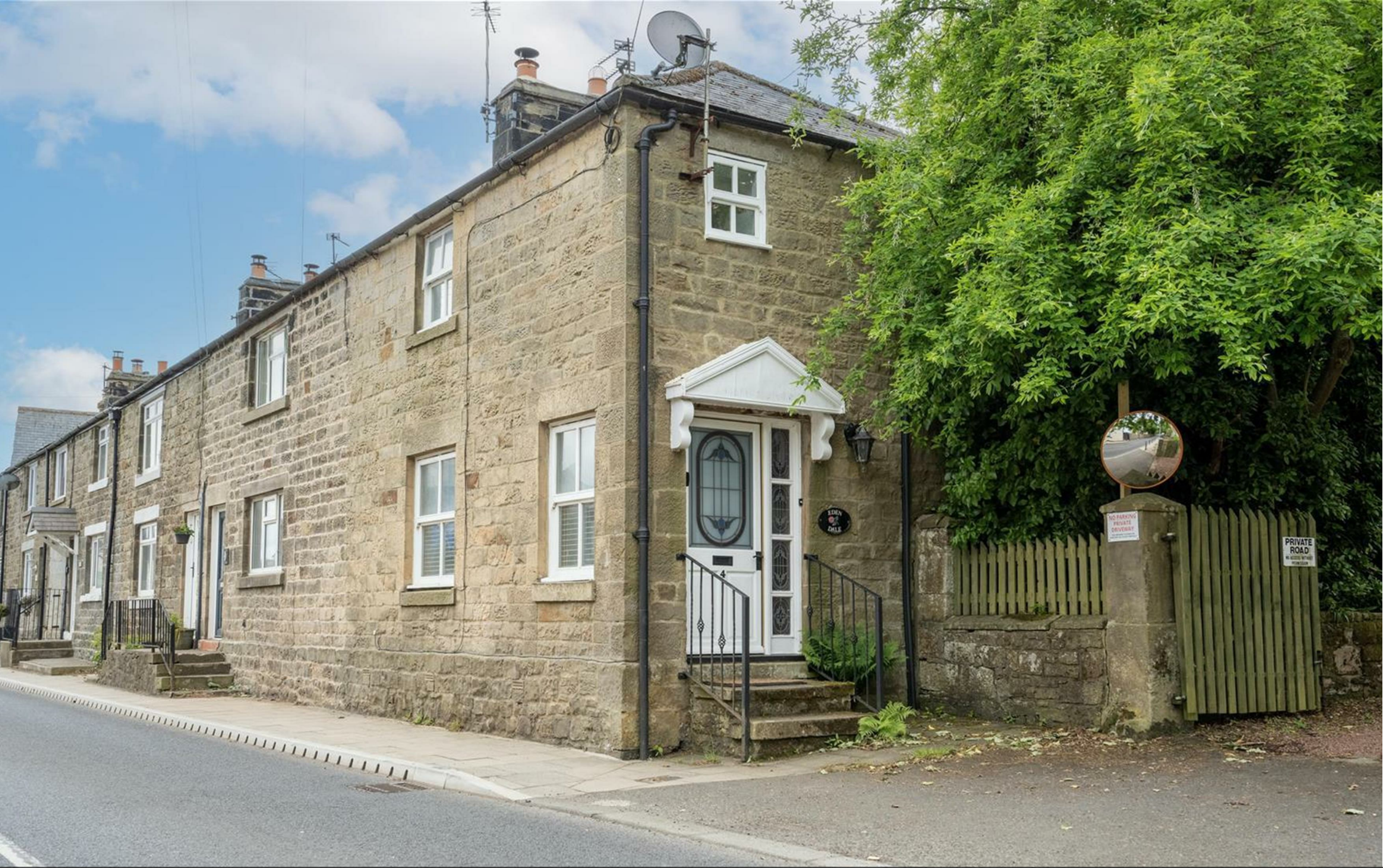
📍 Front Street, Morpeth NE65 8DR